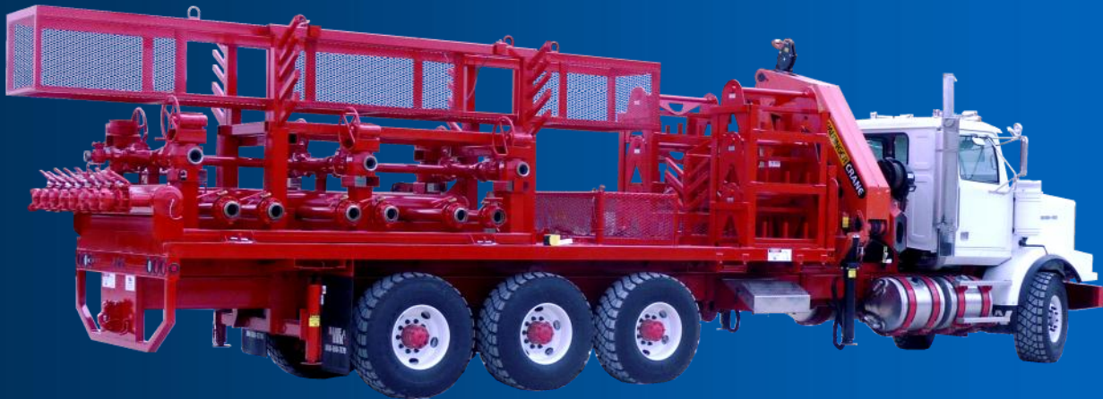
COMBINATION MANIFOLD IRON TRUCK