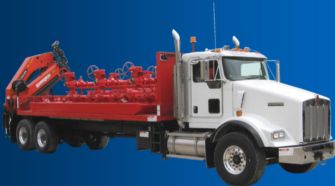
SKID-MOUNTED MANIFOLD TRUCK