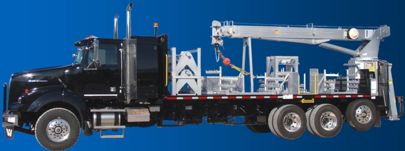
BODY LOAD IRON TRUCK WITH TELESCOPIC BOOM CRANE

CRANEWORKS SPECIALIZES IN SUPPLYING HIGH-QUALITY EQUIPMENT FOR GLOBAL OIL & GAS COMPLETION SERVICES. WORKING CLOSELY WITH OUR CUSTOMERS, WE HAVE DESIGNED, ENGINEERED, AND BUILT OVER 100 CUSTOM BODY LOAD IRON TRUCKS AND CUSTOM IRON TRAILERS WHICH ARE CURRENTLY WORKING AROUND THE WORLD. DUE TO THE REMOTE LOCATIONS WHERE OUR UNITS OPERATE, IT IS OUR GOAL TO BUILD THE LEAST COMPLICATED, MOST RELIABLE PRODUCTS ON THE MARKET. OUR UNITS INCLUDE EITHER AN ARTICULATED OR TELESCOPIC BOOM CRANE TO OFF-LOAD ON LOCATION. OUR IRON TRAILERS INCLUDE A DIESEL DRIVEN SELF-CONTAINED POWER PACK SO THAT IT CAN BE USED INDEPENDENT OF THE TRUCK THAT PULLS IT. WE CAN PROVIDE RACKING CONFIGURATIONS FOR ANY CUSTOMER SUPPLIED IRON LIST.